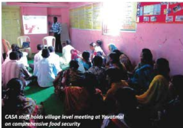
CASA staff holds village level meeting at Yavatmal on comprehensive food security

Maharashtra's eastern Vidarbha region includes Yavatmal where rain-fed crops like cotton, soybean, pigeon peas and chickpeas are the main agriculture in this area. Due to a number of reasons like low rainfall, lack of irrigation and low micronutrients in soil, the productivity of cotton of the region is lower than state (15% less) and 46% less than national averages.