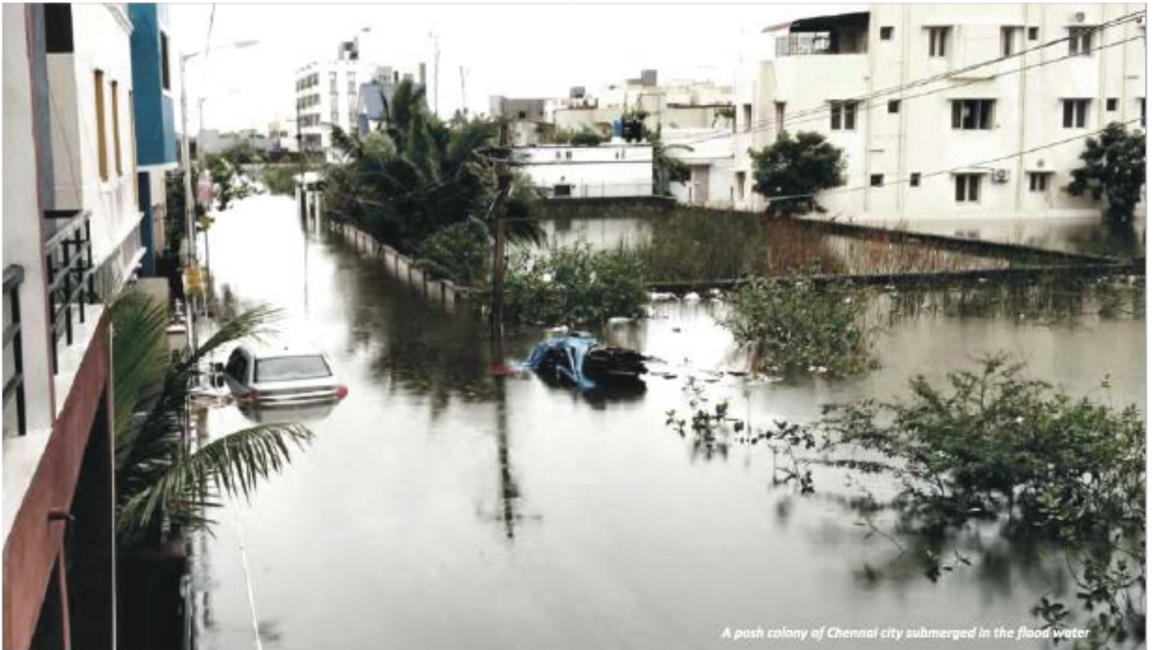
A posh colony of Chennai city submerged in the flood water