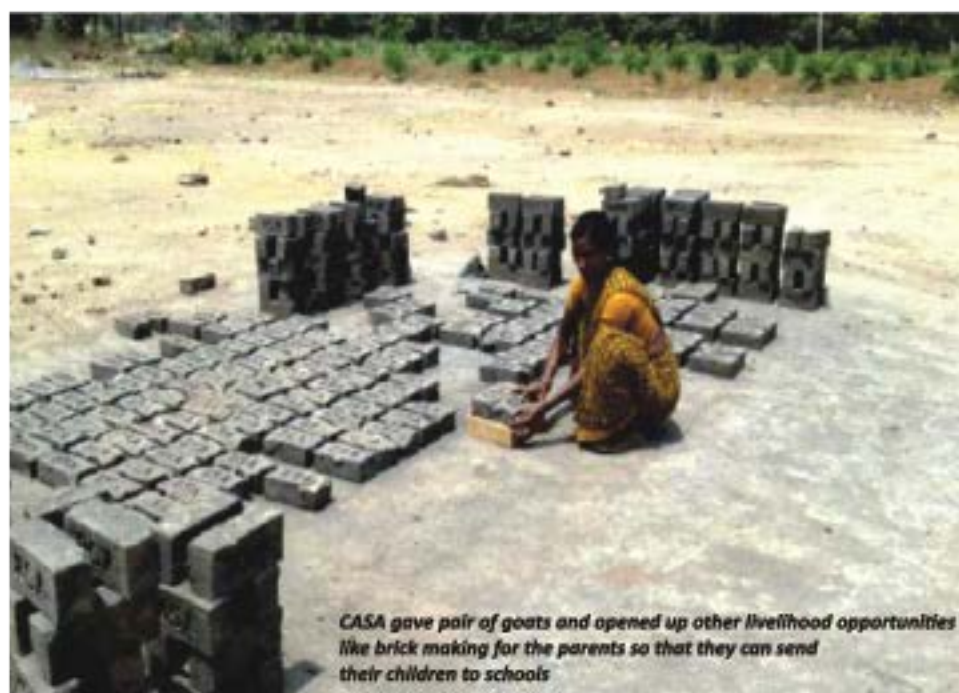
CASA gave pair of goats and opened up other livelihood opportunities like brick making for the parents so that they can send their children to schools

Poverty is one of the main reasons which results in child labour. However, as a child is liberated from the labour to pursue education, the household encounters economic problems and disturbance. In order to fill this gap, Income Generation Programme (IGP) has been introduced to support and increase the family income partially through capital generation for small economic activities – micro enterprises. As an impact, their financial conditions have improved. On top of these, they are also able to educate their children. Twenty parents, whose children were working, were provided with goats in Tamil Nadu for the support of their livelihood and 50 parents in Andhra Pradesh were supported to start different trade like sheep rearing, goat rearing, vegetable vending, basket