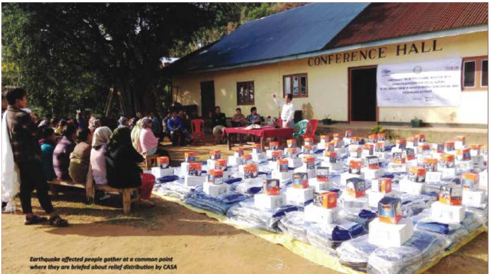
Earthquake affected people gather at a common point where they are briefed about relief distribution by CASA