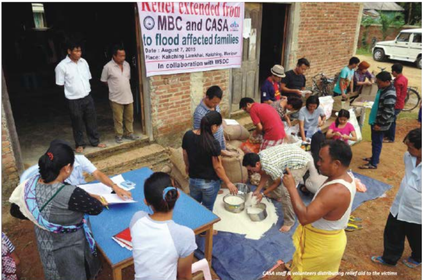
CASA staff & volunteers distributing relief aid to the victims