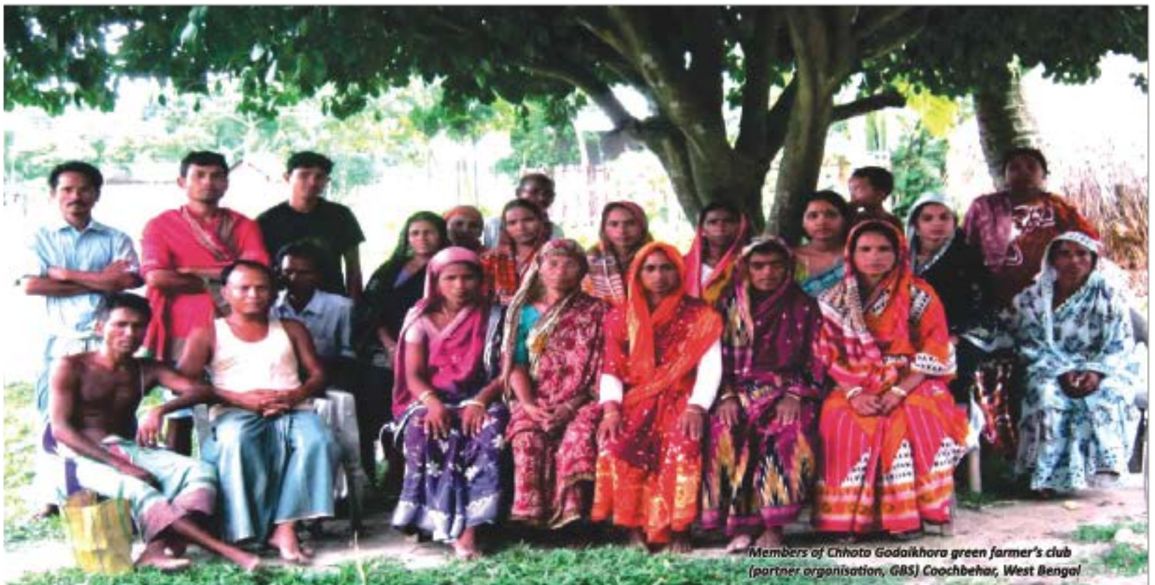
Members of Chhota Godaikhora green farmer's club (partner organisation, GBS) Coochbehar, West Bengal