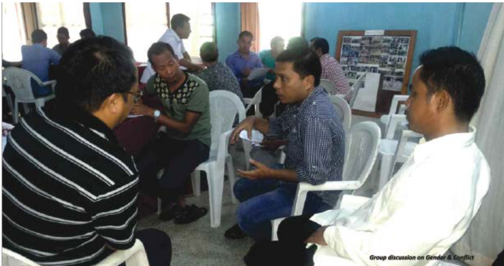
Group discussion on Gender & Conflict